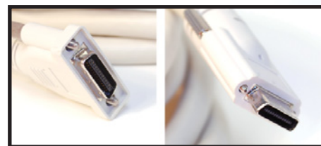
Screw lock connection