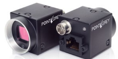
The GIGE-PCIE2-2P02 is compatible with all Blackfly BFLY-PGE camera models